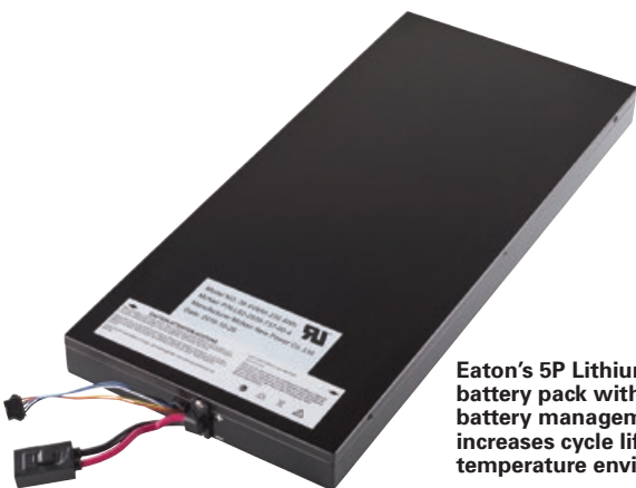
Eaton's 5P Lithium-ion battery pack with on-board battery management — increases cycle life in higher temperature environments.

Building on the success of the 5P UPS platform, Eaton has reduced the weight, improved battery life and lengthened our warranty. These added benefits, in combination with the extended life of the product, provide IT managers with the opportunity to align their UPS refresh cycles with the rest of the IT stack, saving time and money spent on labor and replacement batteries.