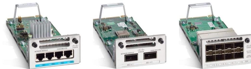
Table 2. Network Module Numbers and Descriptions