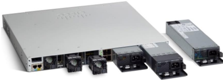
Figure 3. Cisco Catalyst 9300 Series Dual Redundant Power Supplies

Table 3 lists the different power supplies available in these switches and available PoE power.